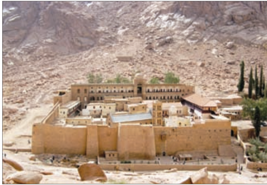
SAINT Catherine's Monastery

Now, seven different Bedouin tribes act as